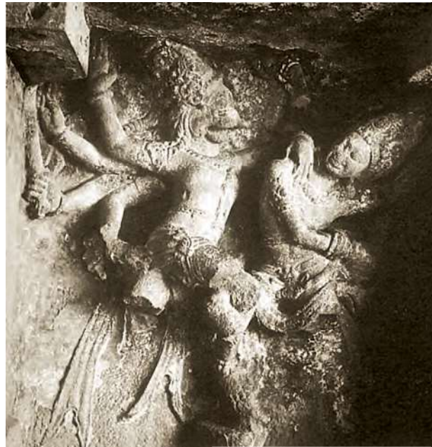
Fig. 1 Wall relief from Cave 15, Ellora, showing Vishnu as Narasimha, the man-lion. It is a work of the Rashtrakuta period.

Many of these new kings adopted high-sounding titles such as maharaja-adhiraja (great king, overlord of kings), tribhuvana-chakravartin (lord of the three worlds) and so on. However, in spite of such claims,