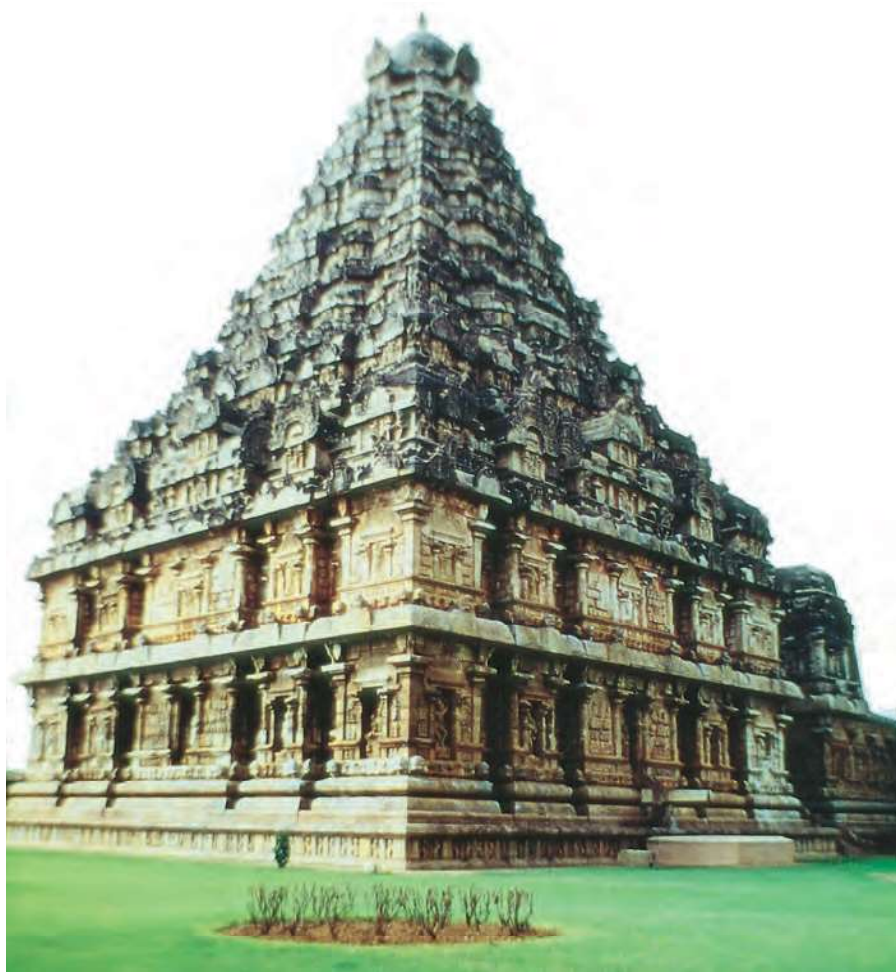
Fig. 3 The temple at Gangaikondacholapuram. Notice the way in which the roof tapers. Also look at the elaborate stone sculptures used to decorate the outer walls.

Chola temples often became the nuclei of settlements which grew around them. These were centres of craft production. Temples were also endowed with land by rulers as well as by others. The produce of this land went into maintaining all the specialists who worked at the temple and very often lived near it – priests, garland makers, cooks, sweepers, musicians, dancers, etc. In other words, temples were not only places of worship; they were the centres of economic, social and cultural life.